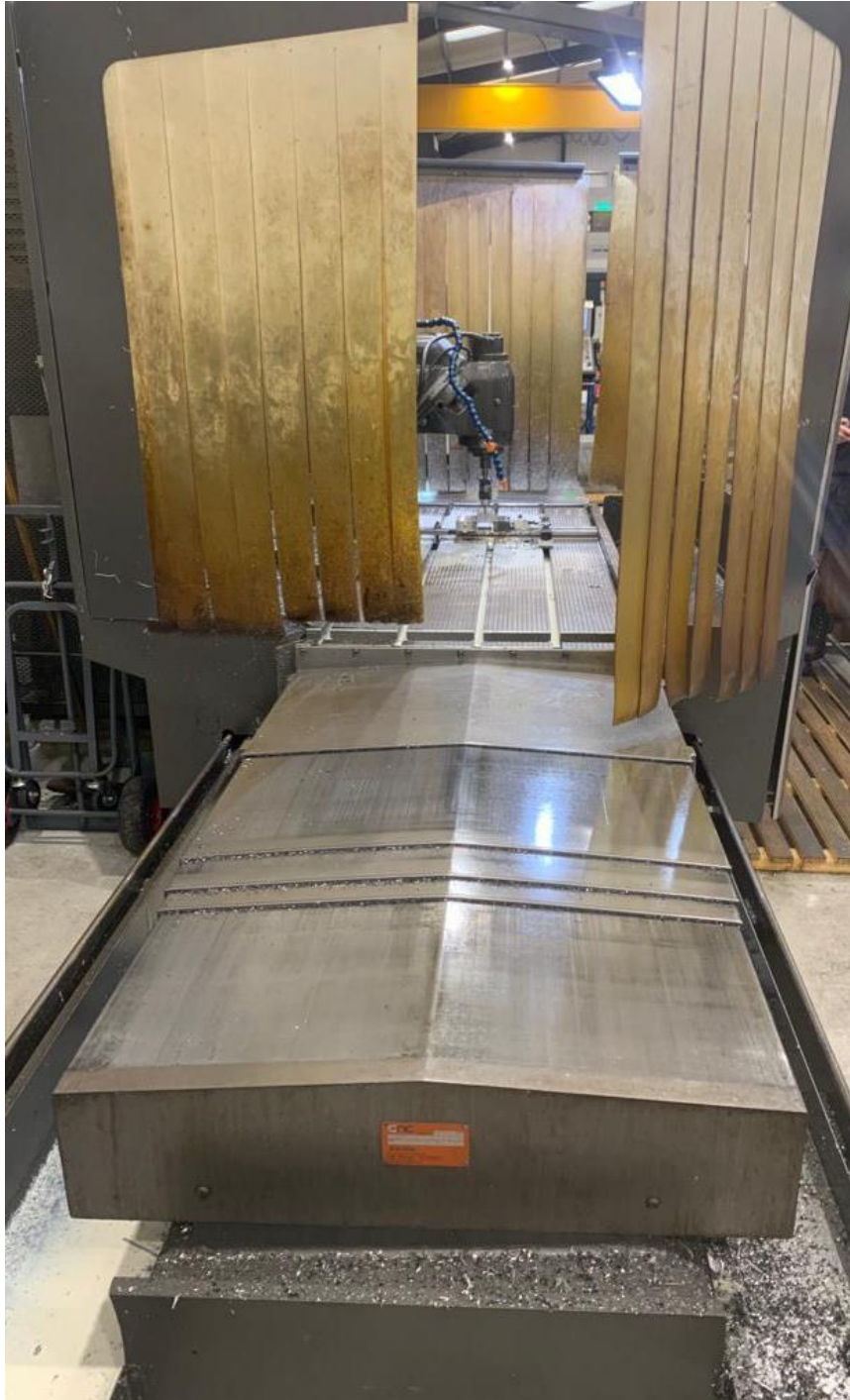
Picture before retrofit

Tél : +33 (0)3 62 52 19 60 Fax : +33 (0)3 20 04 04 24 E-mail : contact@bmos.be Web : http://bmos.fr/